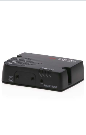
LTE Router Module for wireless data transmission via 4G For GL2000/GL3000/GL4000/GL5000 families

Comprehensive Data Logger Accessories for the GL Logger Families