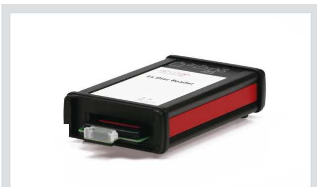
Disc Reader Station for convenient read-out of logging data from SSD For GL3200/GL4200 and GL5000 family