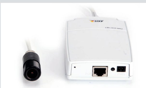
HostCAM Digital camera for high-quality color photos For GL3000/GL4000 families, for GL5000 family camera F44 is additionally available