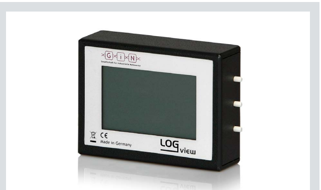
LOGview Display of textual and graphical information For all GL loggers