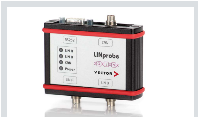
LINprobe External extension for up to 10 LIN channels For all GL loggers