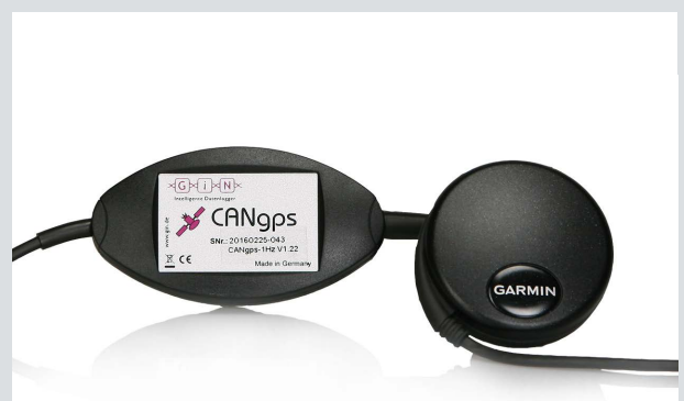
CANgps Logging of vehicle position via GPS For all GL loggers, for GL2000 family an alternative module is available