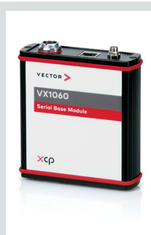
VX1000 Powerful measurement and calibration access to internal ECU data For GL3000/GL4000/GL5000 families