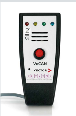
VoCAN Voice recorder to log user comments as well as voice output on specific events For GL2000/GL3000/GL4000/GL5000 families