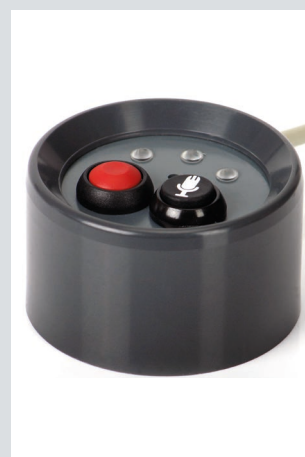
CASM2T3L Voice recorder for logging of user comments on specific events suitable for vehicle cup holders For GL2000/GL3000/GL4000/GL5000 families